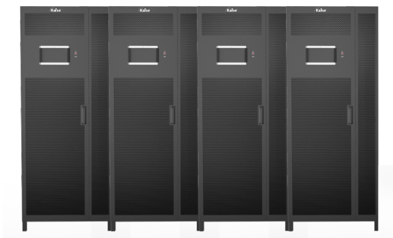
4 units in parallel